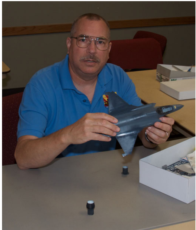
Rich also had his 1/32 Kittyhawk F-5E in the works, and he had done some 3D modeling on

gear doors actually fit the opening in the fuselage which is a good thing as Rich is building this one as an in flight display. He said that the weapons bay was going to be open displaying a full load of modern smart weapons and some detailing still needed to be done. There was a very nice Resin exhaust 3d printed in resin out of Korean but that the interior of the exhaust had practically no detail. He fixed this by designing and printing an exhaust interior.